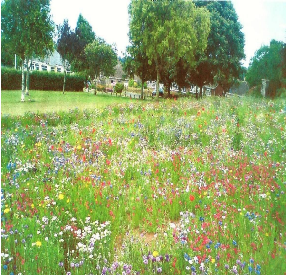
E4 – 11: St. Mary's Park Wild Flower Meadow.

E4 – 11: St Mary's Park. Adjoining the Higher Brixham Conservation Area, commanding panoramic views across the town towards the sea, this much-used park is the most important recreational area in Higher Brixham. Comprising sports field, bowling club, tennis courts and outdoor exercise equipment, it is used by members of the community of all ages. It also hosts the annual Hap'nin music festival, a well-established community organised event that could not be sited elsewhere.