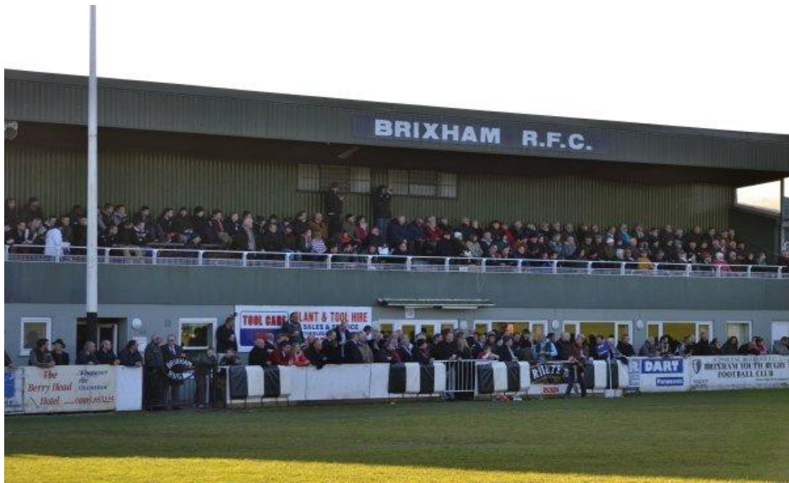
E4 – 2: Astley Park, home to Brixham Rugby Football Club.

E4 – 3: Battery Gardens. A site of great historical importance as well as aesthetic, natural and ecological value, home to the Brixham Battery Heritage Centre and coastal defences built in 1940. The whole area also commands stunning views across Torbay and to the west to Churston Cove to which it connects via the South West Coast Path.