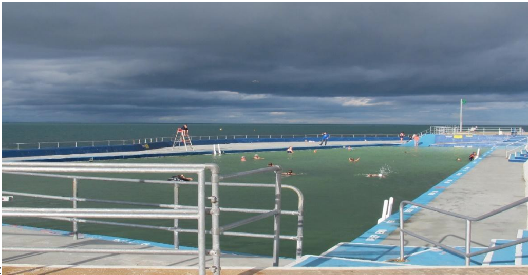
E4 – 9: Shoalstone Pool.

E4 – 9: Shoalstone. This area surrounds a stunning “Art Deco” icon of the South Devon coastline, Shoalstone Pool. This has been a much used recreational amenity for locals and visitors alike since its construction in 1926. Throughout its history, its survival has been entirely dependent on practical and financial support from generations of local communities, none more than today where its very existence owes itself to massive community support.