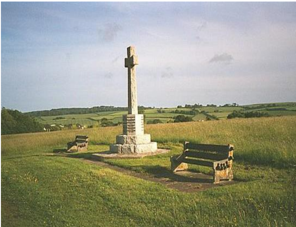
E4 – 15: Galmpton Warborough Common and the War Memorial.

E4 – 15: Warborough Common. This area of unmanaged rich calcareous grassland has been Common Land since 1604. It is prized by locals and visitors for its recreational, historical and ecological value, it functions as the gateway to Galmpton. It boasts natural beauty and outstanding views.