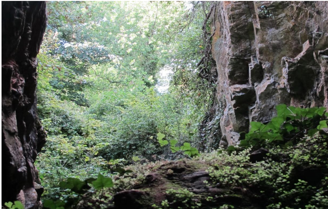
E4 –1: Ash Hole Woods and Cavern entrance.

E4 – 1: Ash Hole Woods. A small woodland area which encloses the entrance to Ash Hole Cavern, a Devonian period limestone cave of great archaeological and geological importance. As such the cavern itself was designated as a Scheduled Ancient Monument (No 33206), and the surrounding woodland designated as an Urban Landscape Protection Area in light of its unspoilt character and conservation interest. It is of importance as a buffer between the built-up areas and the designated Berry Head coastal landscape and is of ecological significance.