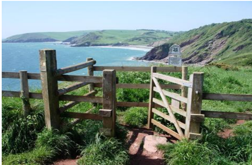
E4 –4: Berry Head National Nature Reserve. Sharkham looking towards Mansands.

E4 – 4: Berry Head. A unique area with many special designations to protect its rare species of flora and fauna of international and national importance as well as its geological status as part of Torbay's "Geopark", its historic siting of two Napoleonic forts that command fine views across Torbay to the north and as far as Portland Bill to the east, ensuring its significance as a SAC in perpetuity. The area includes the SAC, as well as other parts of the AONB which National England suggested be considered for protection after their rejection for housing by this Neighbourhood Plan.